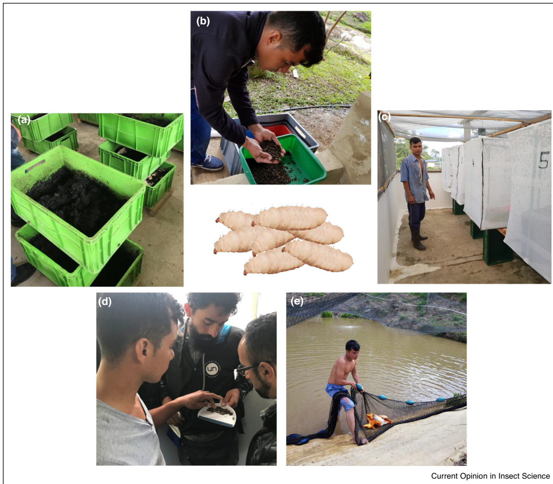
Setting up a black soldier fly culture on farm by ex-combatants. (a) Rearing larvae on organic waste stream, (b) harvesting larvae, (c) rearing adult flies for oviposition, (d) interaction of academic partners and ex-combatants on production of black soldier flies as feed, (e) producing tilapia on farm, fed with black soldier fly larvae as feed ingredient. In the centre, seven full-grown sixth instar black soldier fly larvae are shown.

external inputs. By reintegrating ex-combatants in Colombian society, the production of insects for feed may contribute to SDG 16. Ex-combatants in Icononzo (Colombia) are enthusiastic and have engaged in rearing BSF as an economic option, and want to replicate it in other regions where they have settled. Next steps involve assessing farmer acceptance of integrating insect meal in animal feeds and willingness to pay for insect-based feed, like has been shown in Kenya [13 o ,50]. Moreover, linkages between farmers and the market need to be established to enhance utilization of insect meal as an innovative and locally available feed resource.